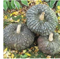
Marina di Chioggia

Australian favorite - Thick sweet orange flesh.