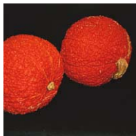
Red Warty Thing