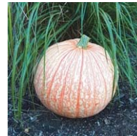
One Too Many

Red veins that crawl across a white background.