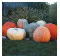
World of Color