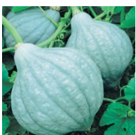
Blue Magic Hubbard

Thick flesh, excellent quality pie or vegetable squash