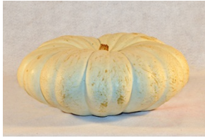
Flat White Boer

Small wren houses to large purple martin house