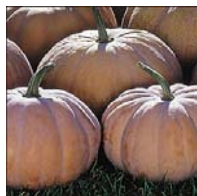
Long Island Cheese